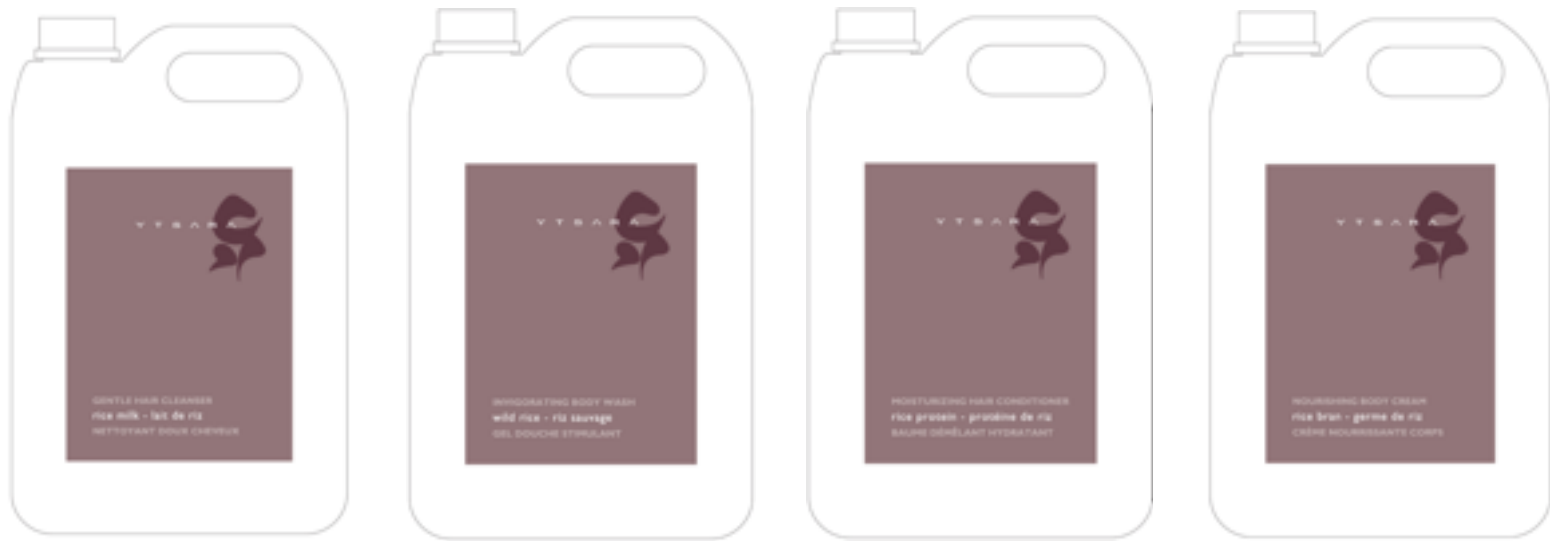
5 L Gallon refills