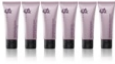
30 ml amenity/ discovery products